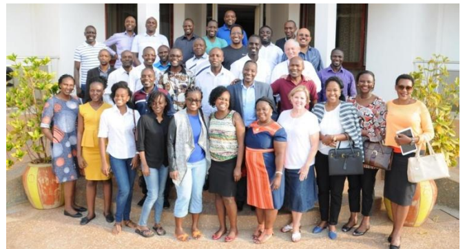
East Africa Training in Rwanda Group Photo