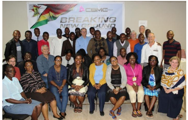
Zimbabwe Convention Group Photo

Enock Omamo God is great! I am starting Operation Timothy tomorrow with my first Timothy CBMC Kenya