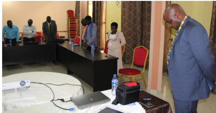
Burundi Vision Casting & Connect3 Training in Burundi